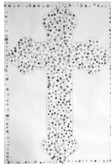
Key Stage 1