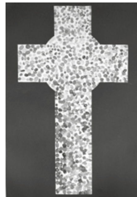
Years 5 & 6