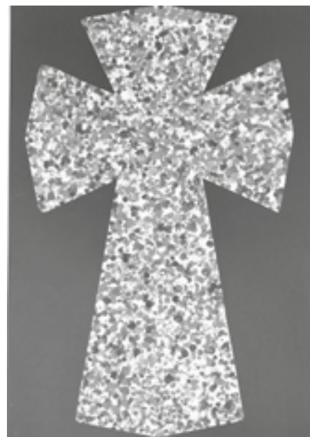
Years 3 & 4