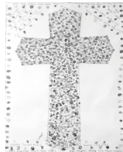
Key Stage 1